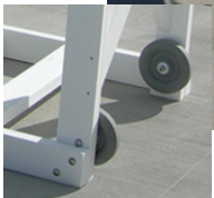
47710 - WHEEL KIT